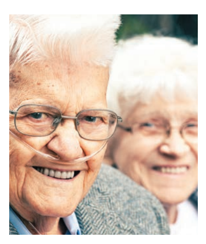
When members become directly involved in running their Club, they are more likely to stay active and committed.