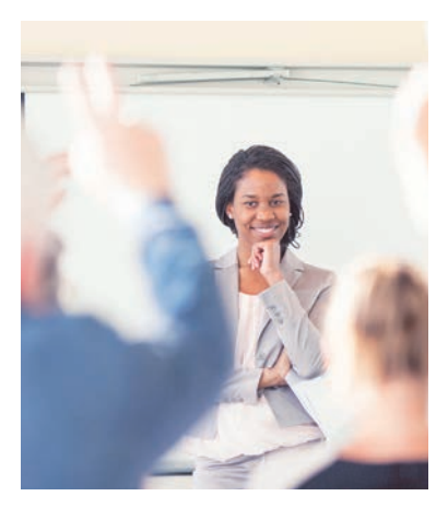
The group's success depends on the involvement of its members, good facilitation by a Certified Facilitator, and community awareness of the club.

phones be turned off. Ask participants to sign the attendance form. They only need to enter their contact information the first time they come unless they have changes to report. Briefly review the group touchstones (see page 22). Thank co-sponsors for their donation to the meeting (such as refreshments, handouts or props). Ask the member who has been in touch with missing group members for a status report.